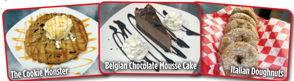
The Cookie Monster

Vanilla ice cream & root beer served in a chilled mug 4.99