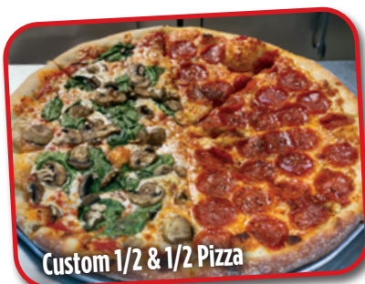
Custom 1/2 & 1/2 Pizza