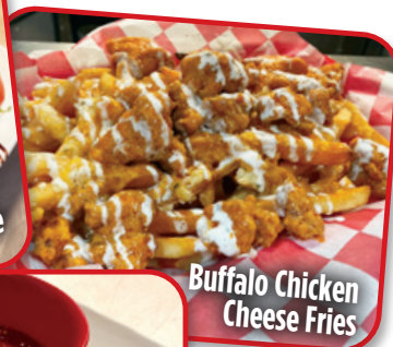
Buffalo Chicken Cheese Fries