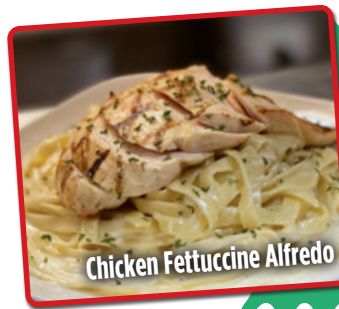
Chicken Fettuccine Alfredo

Penne pasta in our creamy Rosa sauce 14.99 Substitute Gluten Free Penne (contains egg) 3.50