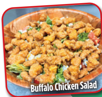
Buffalo Chicken Salad

Lettuce, tomatoes, green peppers, black olives, and shredded cheese. Topped with your choice of grilled or fried chicken 15.99