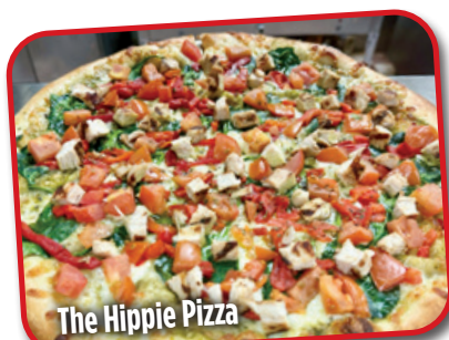
The Hippie Pizza

Basil pesto base, grilled chicken, spinach, tomatoes & roasted red peppers