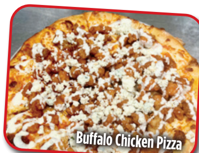
Buffalo Chicken Pizza