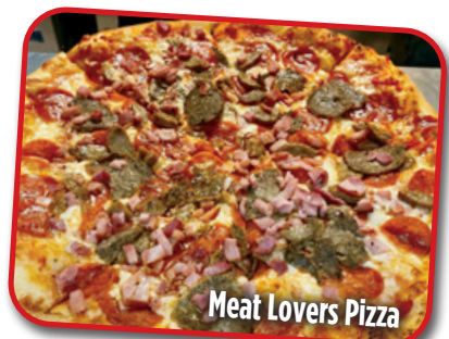
Meat Lovers Pizza