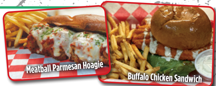
Meatball Parmesan Hoagie

Homemade meatballs smothered in marinara, mozzarella & Parmesan. Baked to perfection 15.99